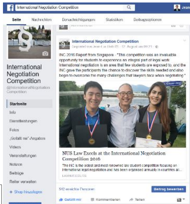
INC 2016 Report from Singapore by the University of Singapore.