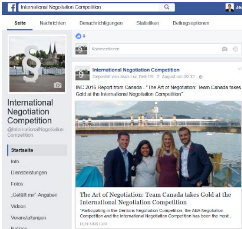
INC 2016 Report by Denton, Canada.

The International Negotiation Competition is the oldest and most renowned law school competition and offers an exceptional educational programme, aiming at filling the gap between practise and legal education. The prospective lawyers participating have an opportunity to apply the knowledge gained at university in an intercultural and international environment. They face real-life scenarios which help them practise negotiation techniques, develop communication skills and enhance their problem solving abilities.